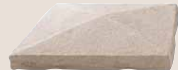
24" x 24" Flagstone Pier Cap shown in Champagne Also available in 32" x 32"