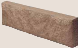
Tuscan Lintel shown in Mocha 6" x 22" x 2½"