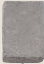
Trim Stone shown in Gray Nominal size 6" x 8" x 17/8"