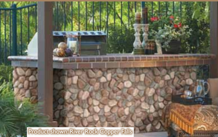
Product shown: River Rock Copper Falls

ProStone® Veneer is an affordable way to turn an ordinary room into a place you want to spend more time. A real living room.