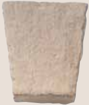
Keystone shown in Taupe 5½" x 8" x 10" x 17/8"