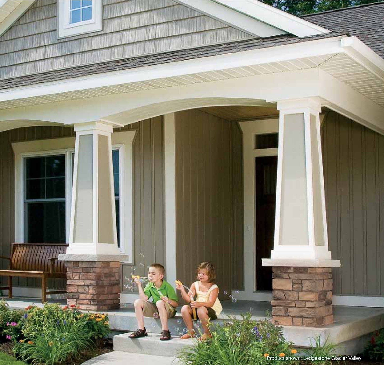
Product shown: Ledgestone Glacier Valley

ProStone® Veneer gives you the look, texture, and pride of stone, at a fraction of the cost of natural stone. It is a realistic engineered veneer that offers a world of design possibilities. When the look of stone is this affordable, your imagination is the only limit. Suddenly, stone is within reach.