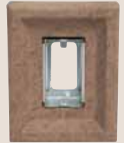
Single Receptical Stone shown in Mocha 6" x 8" x 1¾"