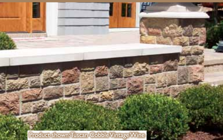
Product shown: Tuscan Cobble Vintage Wine

Bring warmth and character to any part of your home: the kitchen, basement — even an outdoor living space.