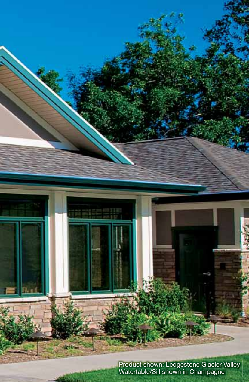
Product shown: Ledgestone Glacier Valley Watertable/Sill shown in Champagne