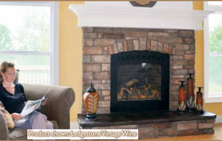
Product shown: LedgeStone Vintage Wine