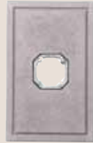
Large Light Fixture Stone shown in Gray 9½" x 15" x 1¾"