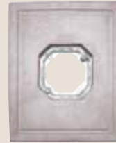
Standard Light Fixture Stone shown in Gray 8" x 10" x 1¾"