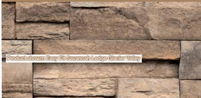
Product shown: Easy Fit Savannah Ledge Glacier Valley